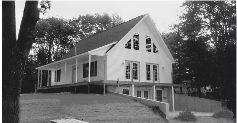
Exteriors depicted may be shown with optional features and site attachments done on site by others.